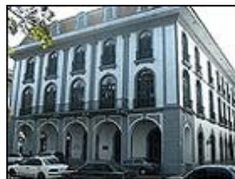
The Museo in Panama City