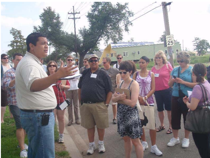
A community leader speaks about rebuilding the Lower 9th Ward